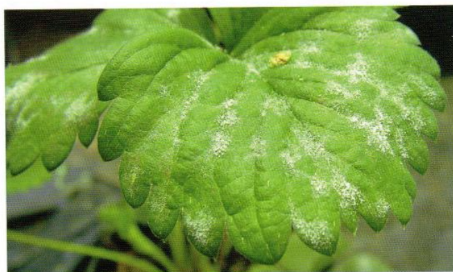
An infected leaf shows the devastating impact of Strawberry Powdery Mildew on plant performance.